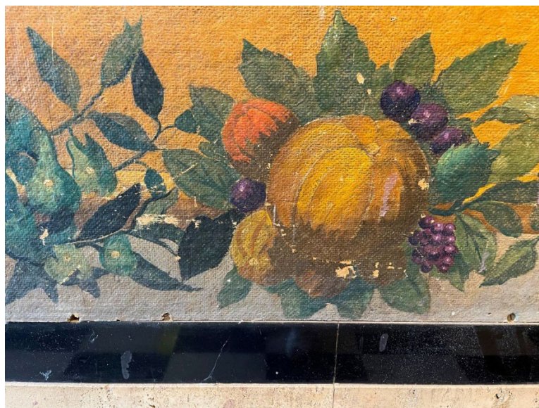
Section of Painting Displaying Holes and Paint Loss

For each painting, Spokeshave Design proposes to construct a protective barrier composed of a wooden top rail and black steel intermediate rails and posts. The barriers would be approximately 9' long and 3' high. The side handrails would be 37" long. The legs or posts would have non-skid foot pads so that the barrier could not be easily moved. These barriers would protect the paintings from being damaged again. The design of the barriers meets ADA standards, with the intermediate rails being within cane sweep. Attached to the barriers, each restored painting would feature a plaque containing the name of the painting and its description. The plaque would also acknowledgement the CPA funding award.