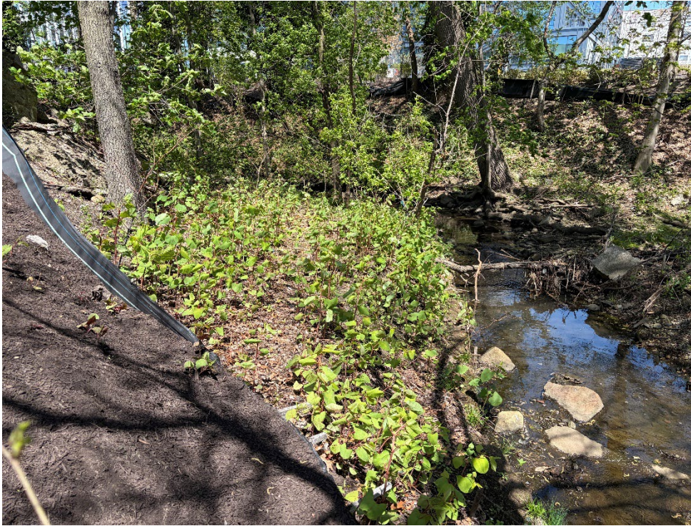
NO. 5 / 5.5.2026