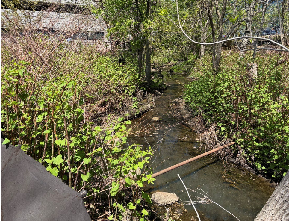
NO. 1 / 5.5.2026