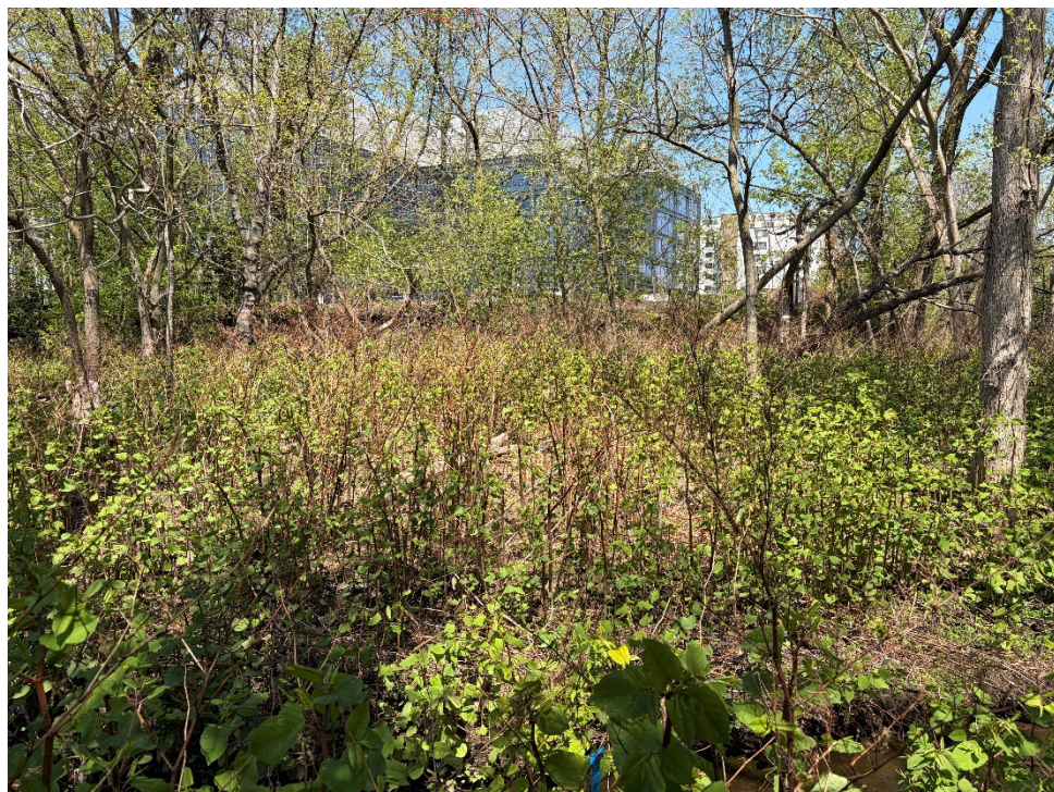
NO. 2 / 5.5.2026

Areas within the photo are within the designated herbicide treatment area.