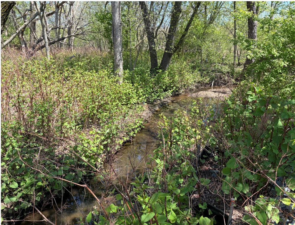
NO. 3 / 5.5.2026