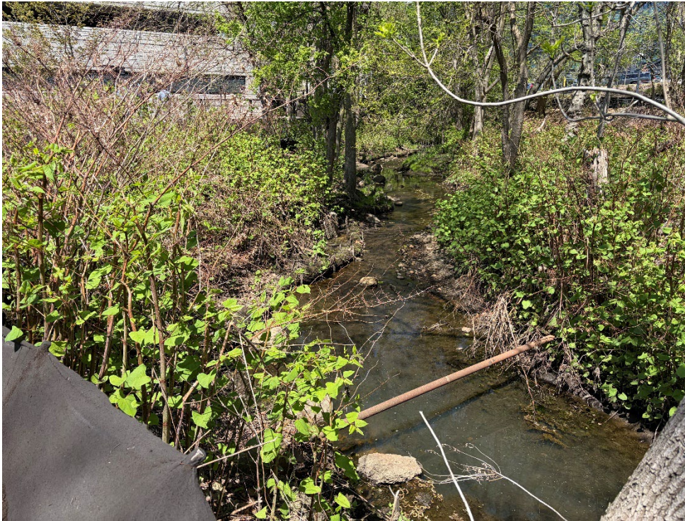
NO. 1 / 5.5.2026